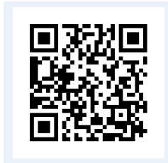
It Doesn't Have to Hurt

Scan this QR code on your phone to watch a quick video about how to make blood work easier for your child.